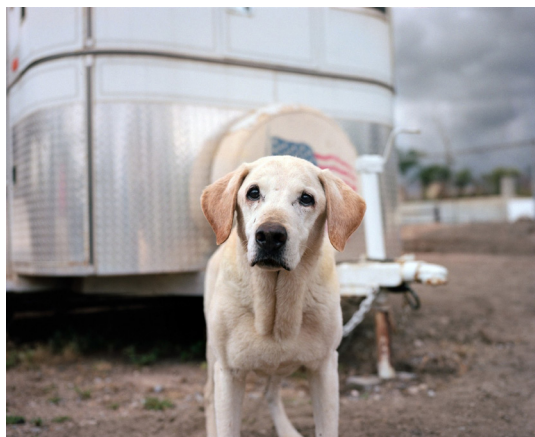
3 © Charlotte Dumas / Courtesy andriess eyck galerie, Amsterdam