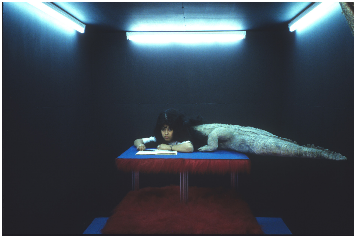
1. La femme croco, Paris, 2000

EXHIBITION FROM JULY 2 TO AUGUST 27, 2016