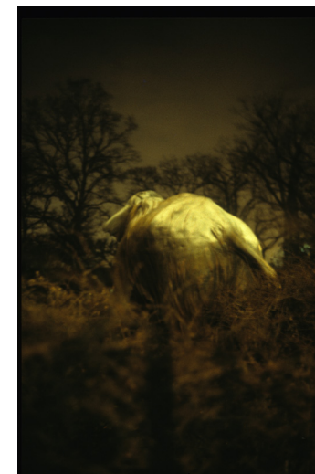
4. © Dolorès Marat courtesy Galerie Française Besson